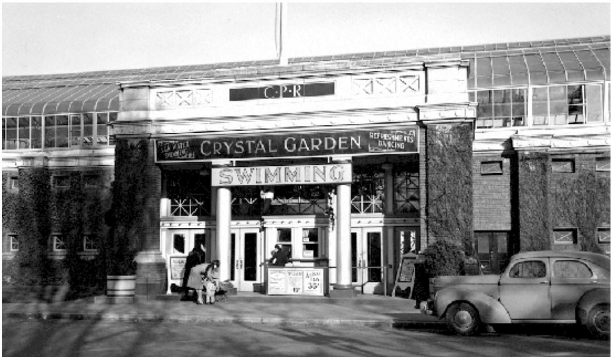
Crystal Gardens 1946

The VASC hosted the B.C Championship Swimming Gala which was held at the Crystal Garden Swimming Pool on Saturday June 1 st 1946.