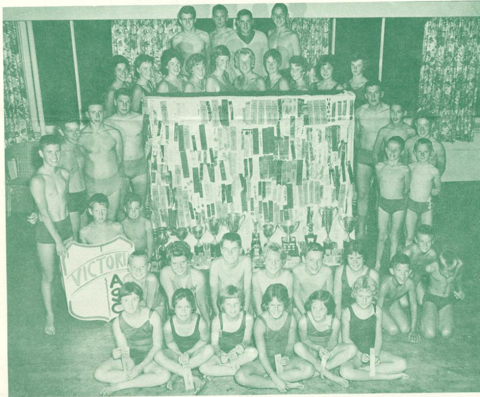
THE V.A.S.C. SWIM TEAM — SEPTEMBER 1962