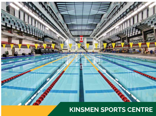
KINSMEN SPORTS CENTRE