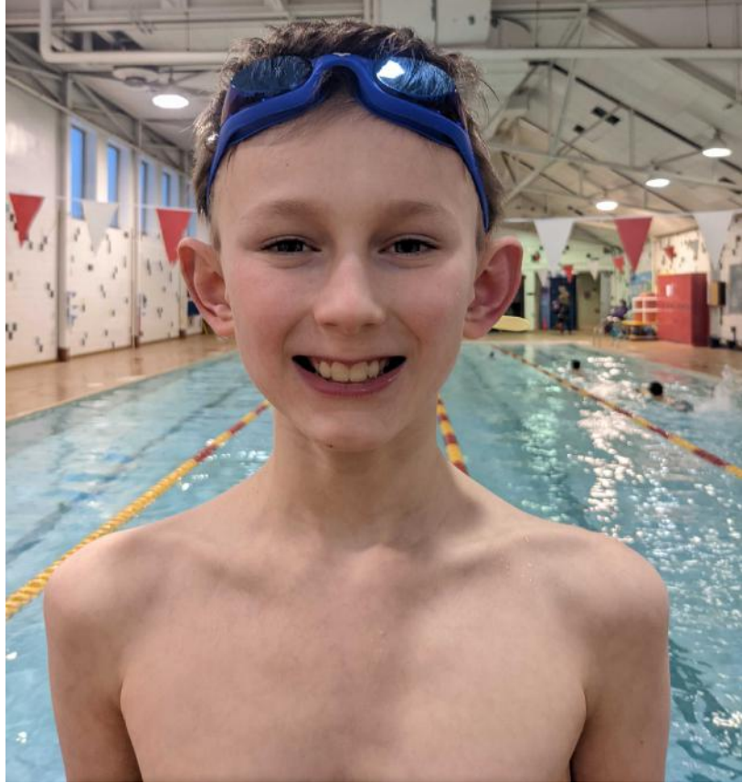
Fountain Park JD