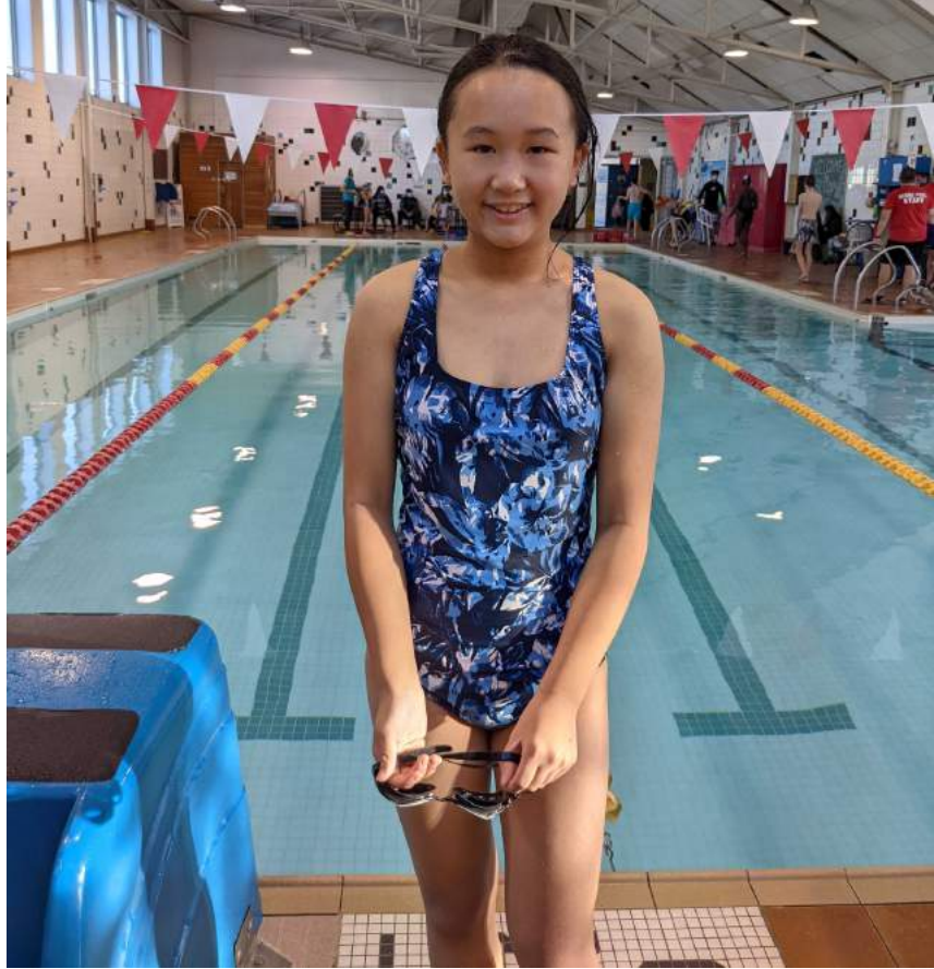
Fountain Park JD