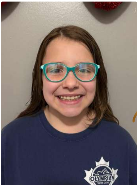
Fountain Park Junior Olympic Way 1