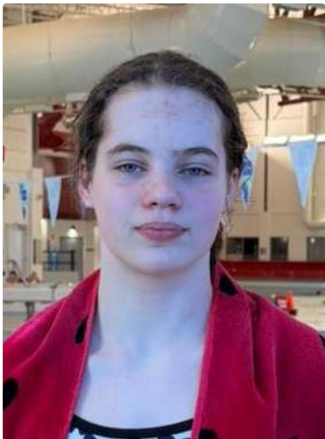
BJRC Junior Olympic Way 2