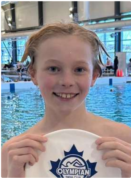
BJRC Junior Olympic Way 1